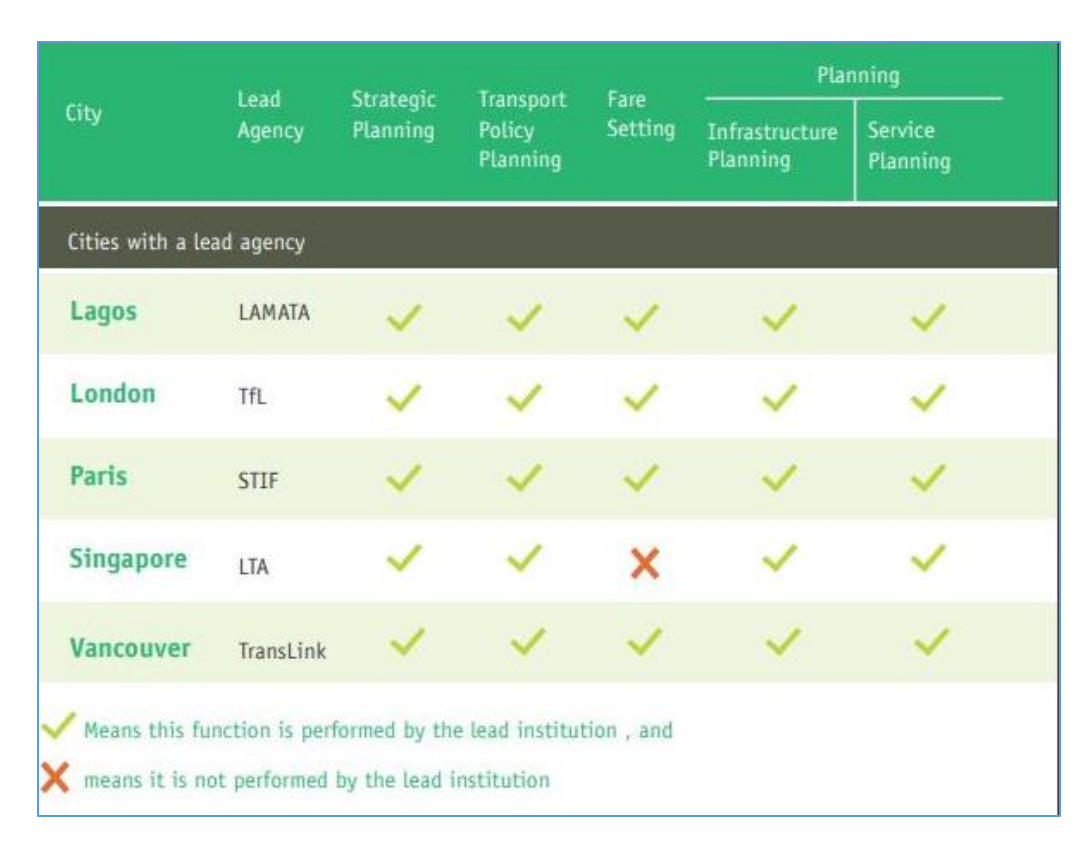
Figure 2: Functions of lead institutions

Once the lead agencies have been set up, the next step involves the definition of the functions it needs to perform. Figure 2 gives a glimpse into the functions performed by different lead agencies in some international cities.